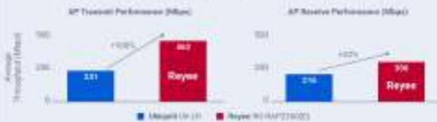
4x4:4 MIMO Wi-Fi 6 Access Point Wireless Performance - Single Client - 2.4GHz Radio (as reported by Keyight Software)

Note: Average of five runs. AP and client in standard channel 36 channel. All tests run in auto channel with 40MHz bandwidth. The testing was performed with the Ubiquiti U6-LR and Reyee RG-RAP2260(E) network adapter was used at the client. Source: Tolly October 2021