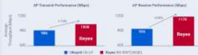
4x4:4 MIMO Wi-Fi 6 Access Point Wireless Performance - Single Client - 5GHz Radio (as reported by Keyight Software)

Note: Average of five runs. AP and client in standard channel 36 channel. All tests run in auto channel with 40MHz bandwidth. The testing was performed with the Ubiquiti U6-LR and Reyee RG-RAP2260(E) network adapter was used at the client.