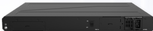
Rear Top View of the RG-WALL 1600-Z5100-S