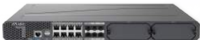
Front Top View of the RG-WALL 1600-Z5100-S